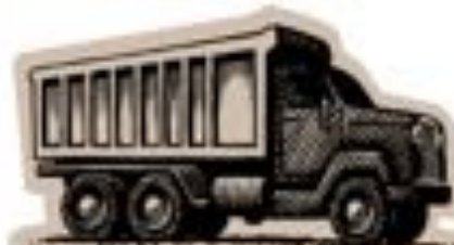
Crushed Stone – Sand – Top Soil