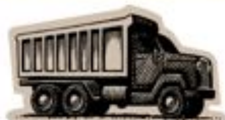
Crushed Stone - Sand - Top Soil